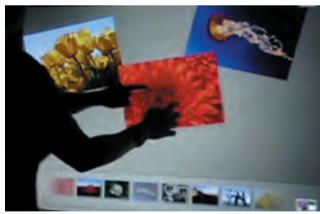
Touch Screen Technology

explain their ideas and concepts and enables her to solicit information from them.